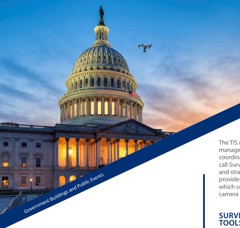
Government Buildings and Public Events